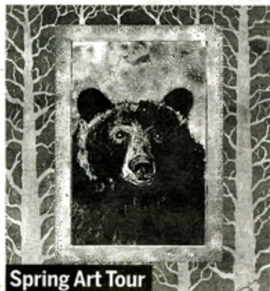
Spring Art Tour

More than 30 years after it was released, "Breaking Away" still holds